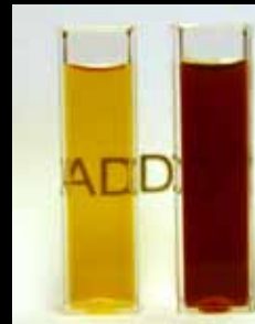
Motor oil with ADDO® (left) - without ADDO® (right)

After 25,000 km - (City bus, 1:100 dilution)